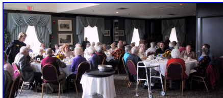
The Crowne Plaza-75 guests!